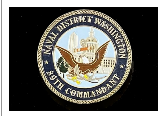
APF Coin with the position but not the name of the Commandant. Yes, we know. It's a Navy coin.....

mander, Air Force Material Command) on these coins. You may never engrave or stamp your name on APF or NAF coins. Exceptions to this rule are the SecAF, USecAF,