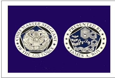
Personal Coin of 16th CMSAF

IMPORTANT! If you plan to use protected Air Force marks or imagery (the Air Force seal, emblem, etc.) on personally procured coins, you must first receive authorization and follow display guidelines. To