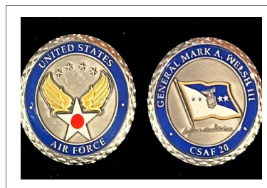
Not an ORF Coin. We just felt bad about including a Navy coin so.....one more for the DAF!

It's important to note that only certain officials have the authority to provide official